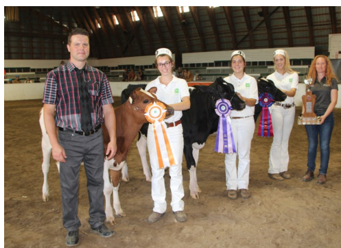
Grand Champion Interbreed