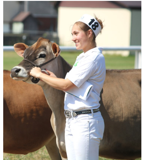
Grand Champion Interbreed

Savannah Crack Richmond LOOKOUT JOEL SHE'S SPICY