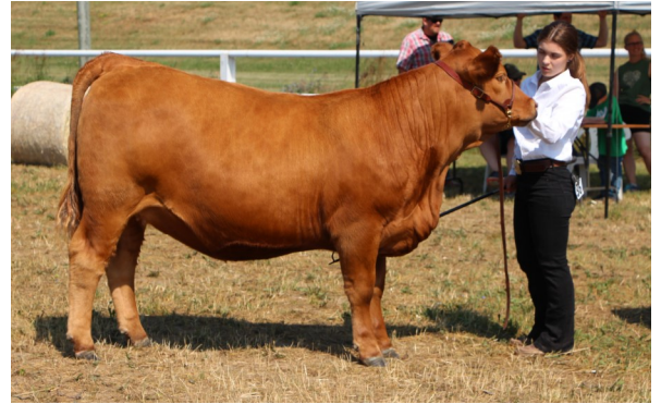
Grand Champion Interbreed

Reese Rusenstrom Shawville MAF SEANNA 129J