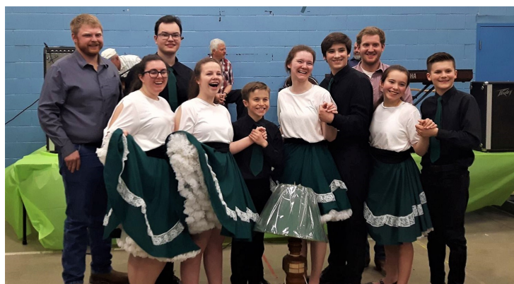
Ormstown Team at the 2019 Ormstown 4-H Square Dance Competition