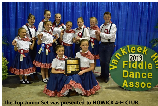
The Top Junior Set was presented to HOWICK 4-H CLUB.

Participants judge 14 classes in 2 categories.