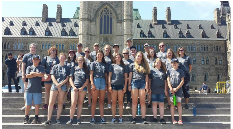
Ormstown and Howick 4-H members

Info: https://4-h-canada.ca/citizenship-congress